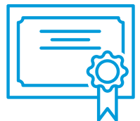
Certificates & Reporting